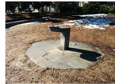
6. EXISTING DRINKING FOUNTAIN