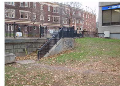
1. EXISTING STAIRS AND WROUGHT IRON RAILINGS