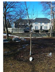
4. EXISTING MEMORIAL TREE