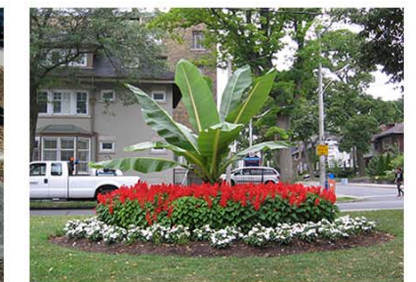
9. EXISTING PLANTING BED