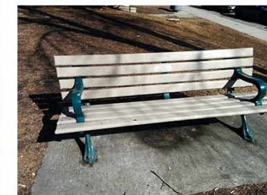
8. EXISTING MEMORIAL BENCH