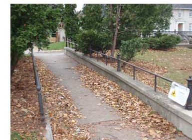
7. EXISTING CONCRETE RAMP