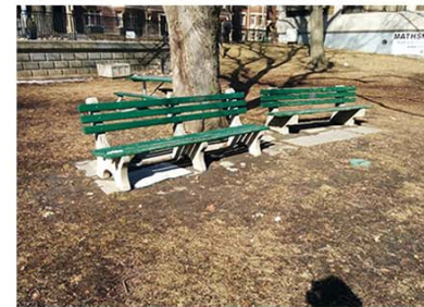
3. EXISTING BENCHES ON PRECAST SLABS