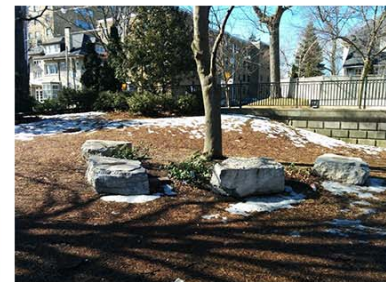
5. EXISTING ARMOURSTONE BLOCKS