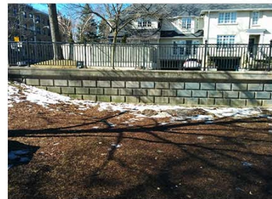
2. EXISTING RAILING AND CONCRETE RETAINING WALL